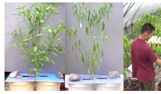
Chili plants with separated roots Left : half roots waterlogged Right: whole roots waterlogged